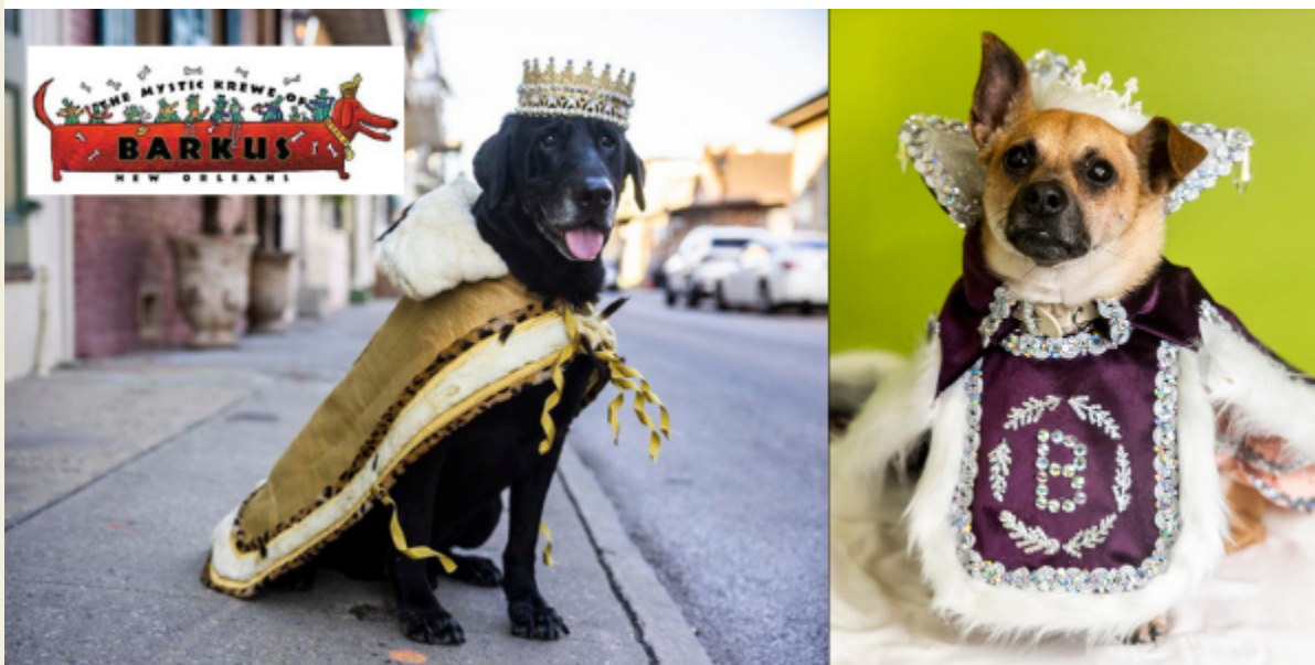
All Hail King Jumpin’ Jack Flash, and Queen Mabel!

Early this week we started hearing rumors about Homer Plessy School moving out of the French Quarter. Last night, a community meeting was held for parents to discuss that potential reality. A petition has been circulating to “Save our French Quarter School” and has already gained 1,200 signatures. We share the residents’ and neighbors’ concerns. Our school contributes to the viability of the French Quarter as a neighborhood and is an integral part of keeping the residential areas thriving. Keep the Plessy kids in the Quarter!