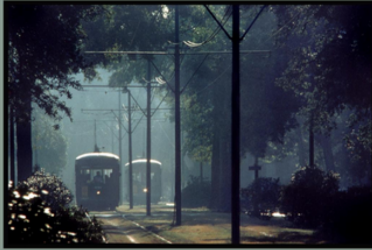
PHOTO WORKS n e w o r l e a n s