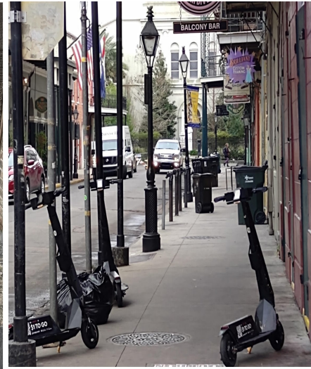
E-scooters on Frenchmen, Conti, and Orleans